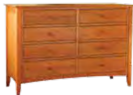
Eight (8) Drawer Dresser 57w x 20d x 21h - N121