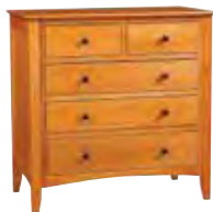
Five (5) Drawer Dresser 38w x 20d x 38h - N118