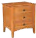
Three (3) Drawer Dresser 25w x 20d x 27h - N117