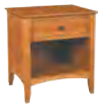
Night Stand 25w x 20d x 27h - N116

The Newport Bedroom Collection contains selected features of the shaker style for inspiration of the design for this collection. There are two distinct bed designs in this collection: the inset panel bed and the picket style bed, both with a pronounced arch feature on the footboard. Both beds are designed for use with mattress and box springs and include hardwood side rails and wood slats. The case collection includes a variety of dressers all featuring dovetail custom fitted inset drawers, a wood under-mount glide, a matching arch to the bed and a solid waterfall top.