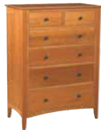
Six (6) Drawer Dresser 38w x 20d x 51h - N119