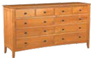
Ten (10) Drawer Dresser 70w x 20d x 38h - N122