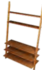
Leaning TV Stand with Leaning Bookcases All fixed shelves

Spectra Wood is committed to designing and building heirloom quality furniture that will last many lifetimes. Using solid hardwoods from local forests and initiating innovative crafting techniques that use less energy, have less waste, and utilize only eco-friendly paints and finishes, assures a sustainable and environmentally conscious product.