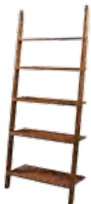
72" Leaning Bookcase Leaning Bookcase 32w x 17d x 76h - L100 Leaning Desk 32w x 24d x 76h - IL101 All fixed shelves