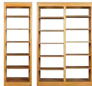
72" Open Bookcases 24" Open (left) - 24w x 17d x 72h - L200 48" Wide Open (right) - 48w x 17d x 72h - L201 All adjustable shelves