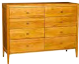
Eight (8) Drawer Dresser 53w x 19d x 38h - K113