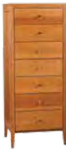
Seven (7) Drawer Lingerie 22w x 19d x 55h - K111