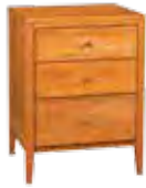
Three (3) Drawer Dresser 22w x 19d x 30h - K109