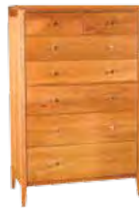
Seven (7) Drawer Dresser 35w x 19d x 55h - K112