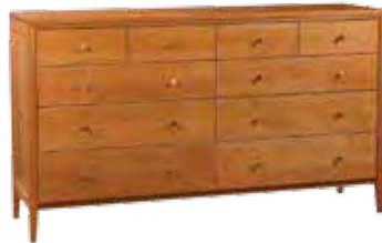
Ten (10) Drawer Dresser 69w x 19d x 38h - K114