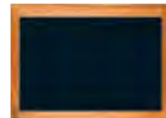
Horizontal Mirror 40w x 1d x 28h - K116