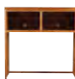
48" Entertainment Hutch 48w x 17d x 48h - F172 60" Entertainment Hutch 60w x 17d x 54h - F173 72" Entertainment Hutch 72w x 17d x 60h - F174