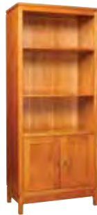
Stereo Unit 30w x 17d x 72h - F175