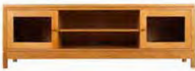
72" Widescreen TV Stand 72w x 22d x 24h - F229