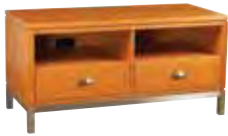
48" Widescreen TV Stand 48w x 22d x 24h - F156

With its trademark one inch thick top, separate base and contemporary design, our Franklin Media collection introduces many pieces to help create a custom home entertainment unit. Various widths and heights make it easy to configure any combination to fit your specific area, as well as offering stained wood, black metal, or stainless steel bases.