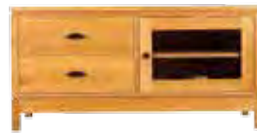
48" Widescreen TV Stand 48w x 22d x 24h - F215