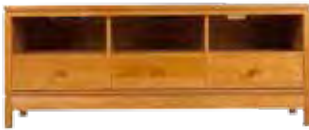
60" Widescreen TV Stand 60w x 22d x 24h - F221