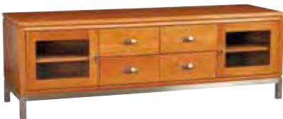
72" Widescreen TV Stand 72w x 22d x 24h - F168