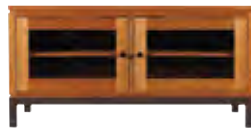
48" Widescreen TV Stand 48w x 22d x 24h - F155