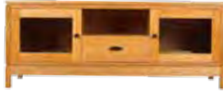
60" Widescreen TV Stand 60w x 22d x 24h - F222