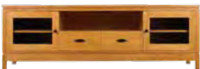
72" Widescreen TV Stand 72w x 22d x 24h - F231