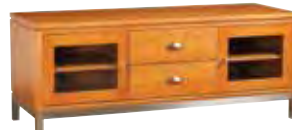
60" Widescreen TV Stand 60w x 22d x 24h - F162