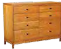
Eight (8) Drawer Dresser 54w x 19d x 38h - F113