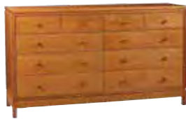
Ten (10) Drawer Dresser 69w x 19d x 38h - F114