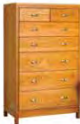
Seven (7) Drawer Dresser 35w x 19d x 55h - F112